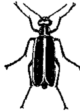
MARGINED BLISTER BEETLE