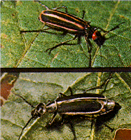
USDA Insect and Plant Disease Slide Set

University of Kentucky College of Agriculture