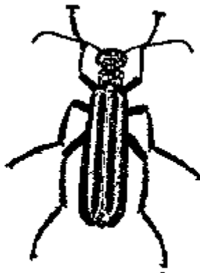
STRIPED BLISTER BEETLE